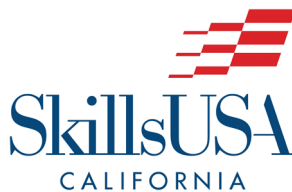
SkillsUSA California State Director