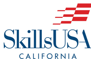
SkillsUSA California State Director