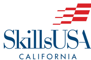
SkillsUSA California State Director