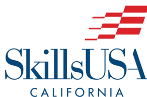
SkillsUSA California State Director